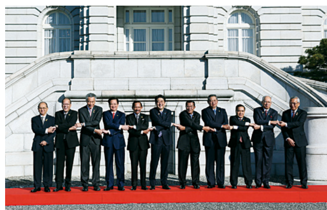
December 2013, ASEAN-Japan Commemorative Summit (Tokyo)

The Asia Center was established within the Japan Foundation to implement the "WA Project" – Toward Interactive Asia through "Fusion and Harmony."