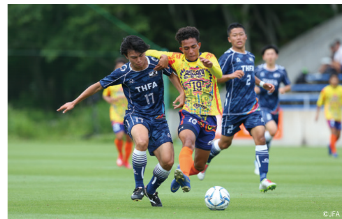
Football Exchange with Southeast Asia "ASIAN ELEVEN"

Held at the National Art Center, Tokyo and Mori Art Museum, this was one of the world's largest showcases of contemporary art from Southeast Asia from the 1980s and onward.