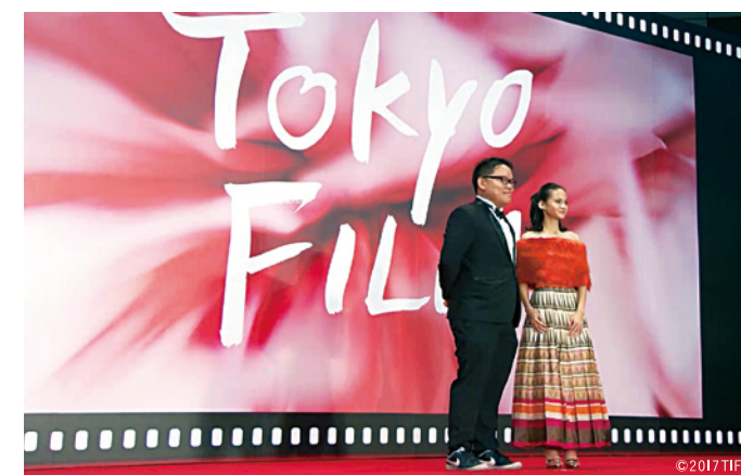
Film Culture Exchange Projects with the Tokyo International Film Festival

By dispatching coaches from Japan and promoting interaction among players, the Asia Center contributes to encouraging the next generation of football in Asia.