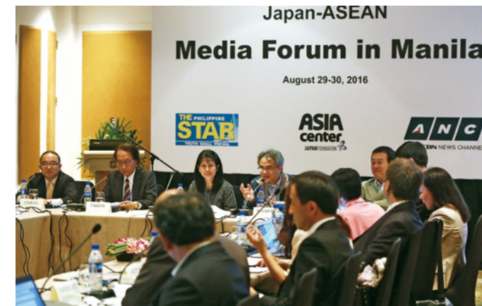
Japan-ASEAN Media Forum

To introduce Asia's new talent, the Asia Center showed films from Southeast Asia, invited Asian film professionals and produced an omnibus film series, "Asian Three-Fold Mirror."