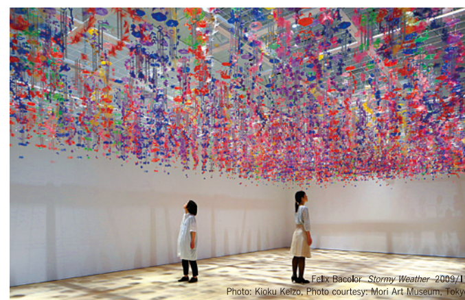
SUNSHOWER: Contemporary Art from Southeast Asia 1980s to Now Exhibition

Held at the National Art Center, Tokyo and Mori Art Museum, this was one of the world's largest showcases of contemporary art from Southeast Asia from the 1980s and onward.