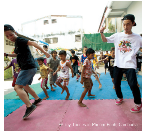
@Tiny Toones in Phnom Penh, Cambodia